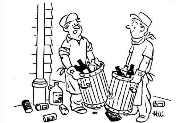
"You know the first thing this guy will worry about? His anonymity!"